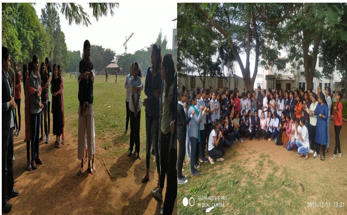
Self-Defense Program (Karate training workshop) organized by college on dated 17 Dec.2019 under Board of student development cell and NSS.