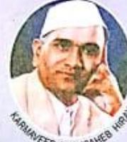
KARMAVEER BHAUSAHEB HIRAK