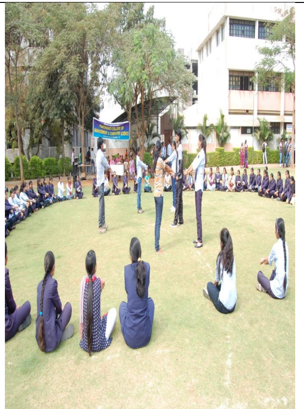
➤ Self-Defense Program (Karate training workshop) organized by college on dated 21 Dec.2017 under Board of student development cell and NSS.