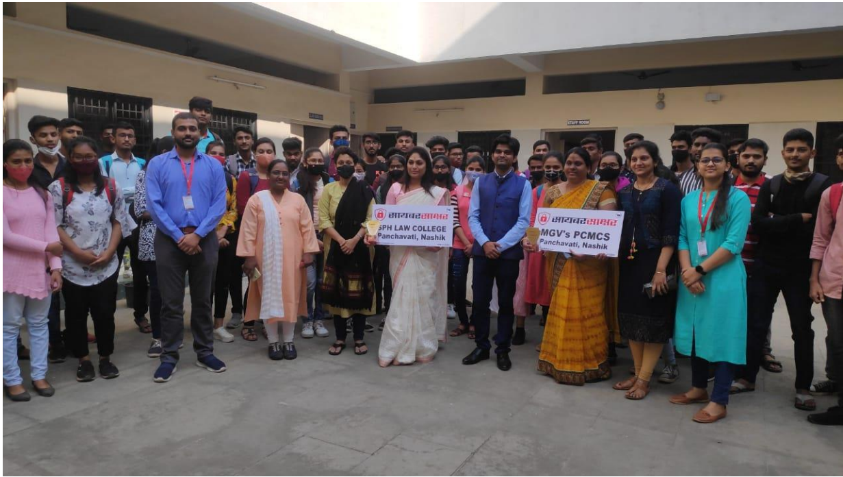
➤ Cyber Security Program conducted on 16 th January 2020